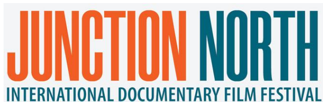
Junction North International Film Festival