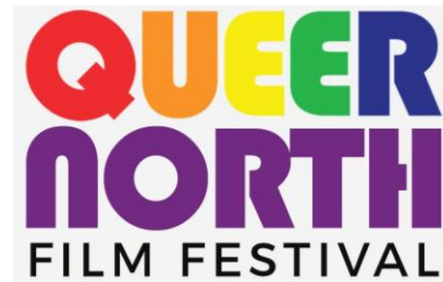
Queer North Film Festival