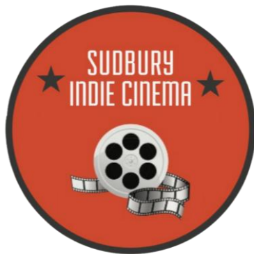
Sudbury Indie Cinema - Circle