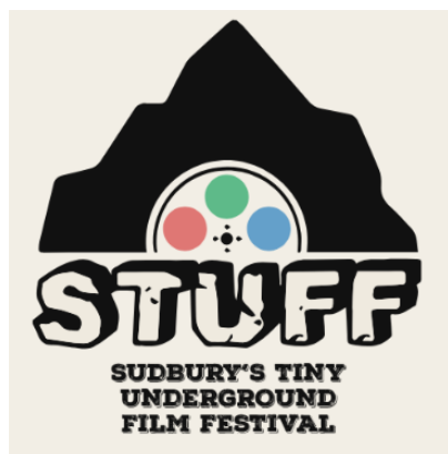
Sudbury's Tiny Underground Film Festival